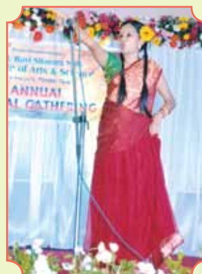
Performing at Annual Social Gathering