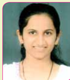
Shaikh Shermin Akbar