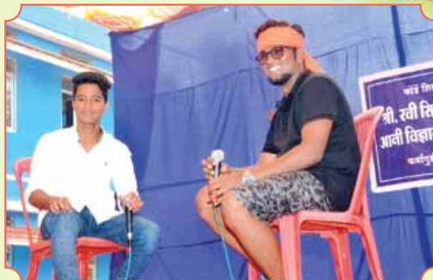
Skit performance at Kala Sangam