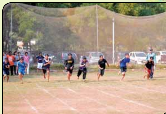
Girl athletes participate in the Annual Athletic Meet