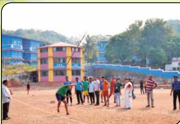
Javelin throw participant in the Annual Athletic Meet