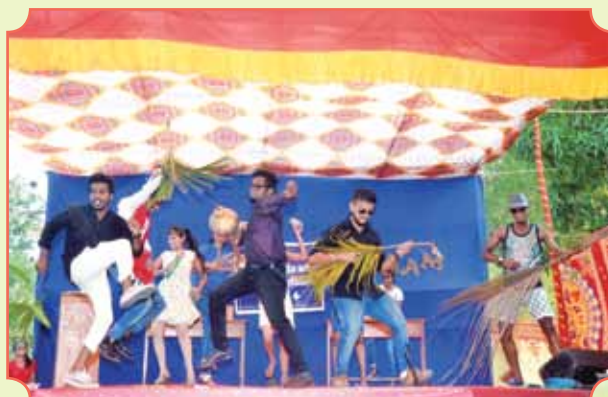
Mute band competition