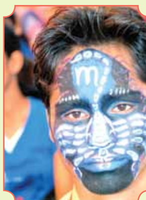
Face painting competition