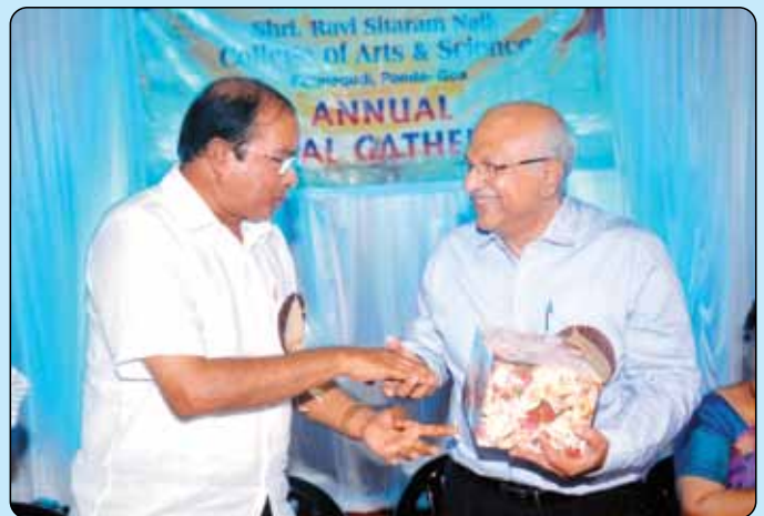
President of Ponda Education Society Shri. Ravi S. Naik giving a memento to Shri. Datta Damodar Naik, Chief Guest at the Annual Social Gathering