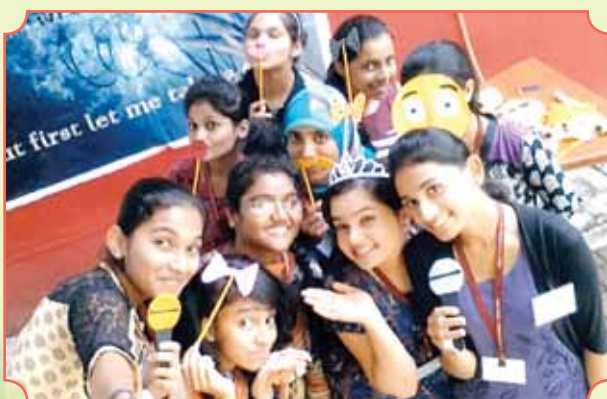
Microbiology students secured second place at Inter-Collegiate event - SYNAPSE 2015 organised by the Dept. of Biotechnology, Chowgule College