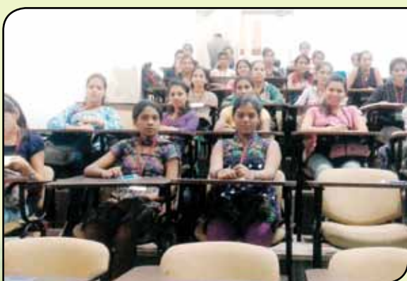
B.Sc. Sem IV students of Zoology attending a Seminar of Aqua-Goa Mega Fish Festival at Navelim, Margao