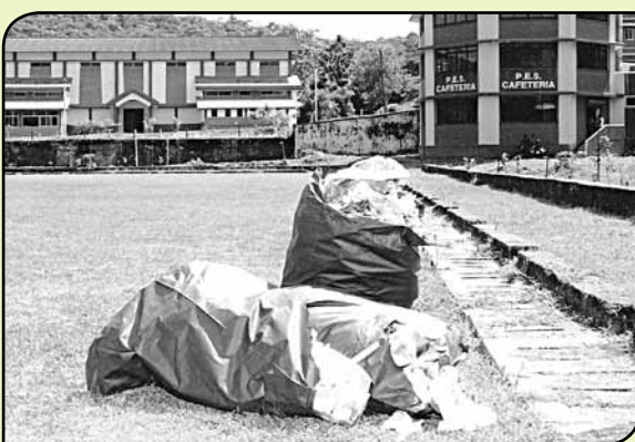
Collection of Plastic Bags for re-cycling by N.S.S. Volunteers from the College Campus