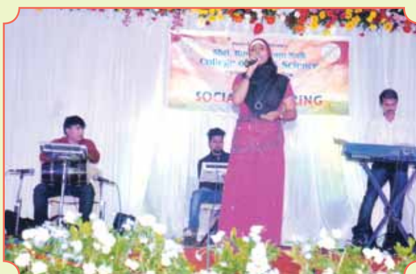
Solo singing at Annual Social Gathering