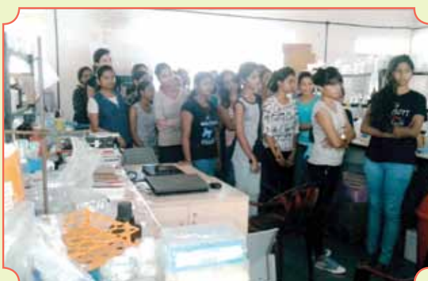
A Visit to BITS Pilani, Goa Campus by T.Y. B.Sc., Microbiology students