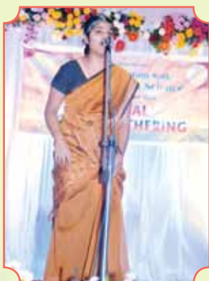
Performing at Annual Social Gathering