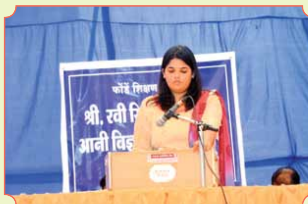
Student performing at Kala Sangam (Talent show of Instruments)