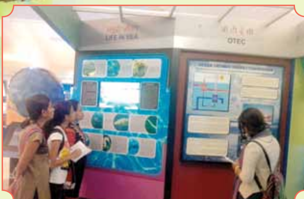
B.Sc. VI Sem Zoology Students Study Trip to Science Centre, Miramar, Panaji