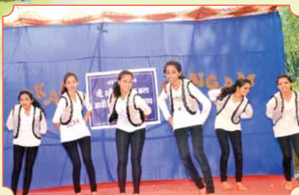
Group dance competition