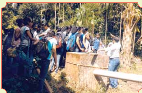
T.Y. B.Sc. Microbiology student's visit to Biogas plant at Shiroda.