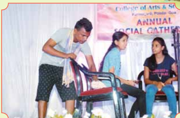
Performing at the Annual Social Gathering