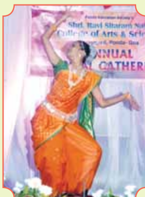
Traditional dance at Annual Social Gathering