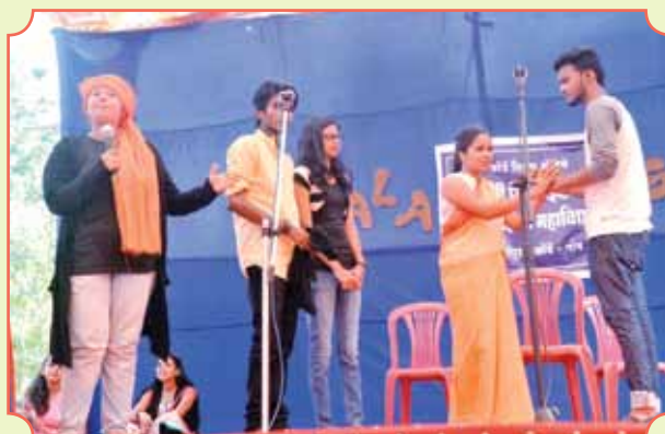
Kala Sangam activities