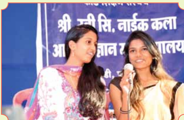
Antakshari participants at Kala Sangam