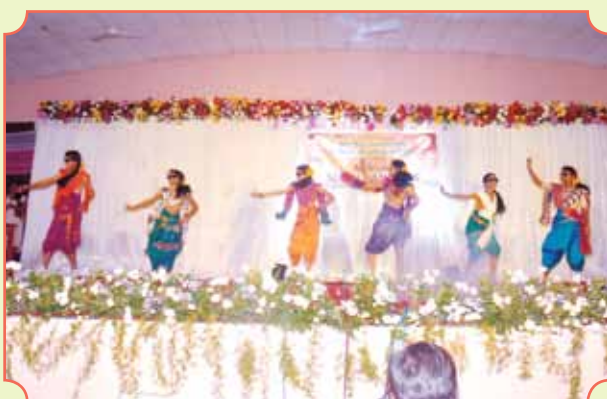
Group dance at the Annual Social Gathering