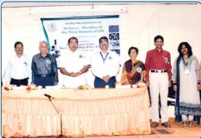
President of Ponda Education Society Shri. Ravi. S. Naik at the One day State Level Microbiology Seminar on 'Archaea: Microbes of the third domain of life' sponsored by DST, Goa