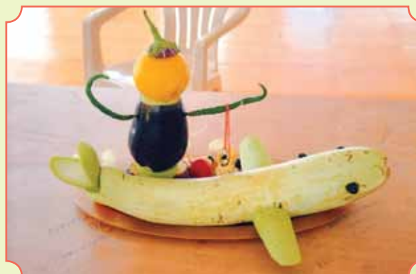
Fruit & Vegetable Carving