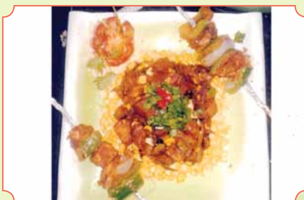
Delicacy prepared by Microbiology students for cooking competition based on preparation of recipes using Microbial products organised by Micro-Tech Cell